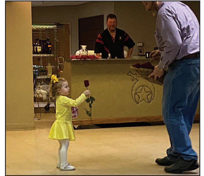
Thanks to the Riders and to everyone who came out!