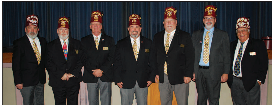
2021 Elected Divan

many of us hold dear, we will continue to grow and thrive because the building is not what makes us Shriners. The bond we share as brothers, the love and respect we have for one another and our Fraternity is what makes us Shriners. We all must come together and support the best interests of Zamora so we can continue for another 129 years.