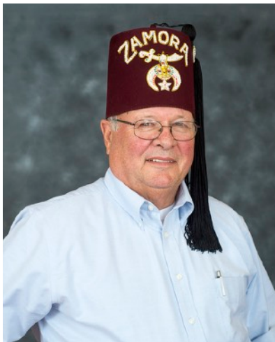
John M. Eaton South Shelby Lodge