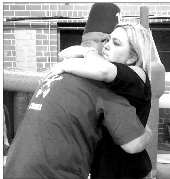
A grateful heart.