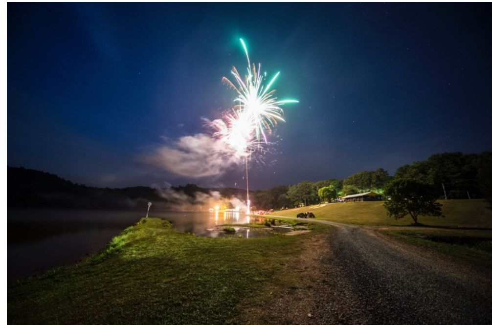
Several hundred people watch the show from the pool area across the lake from the launch area.