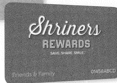
Red Friends and Family Rewards Card