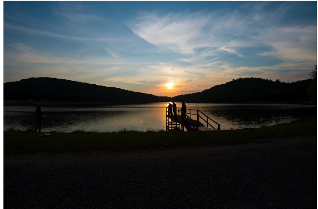
The sun sets on another day at the lake.