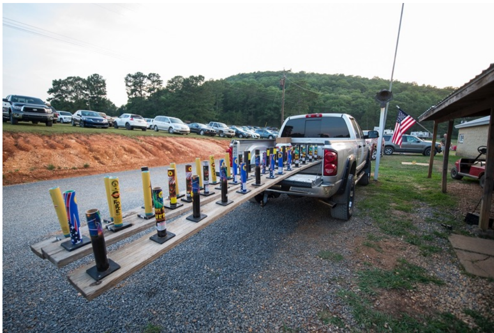
The mortars are prepped and ready to be taken to the launch area.