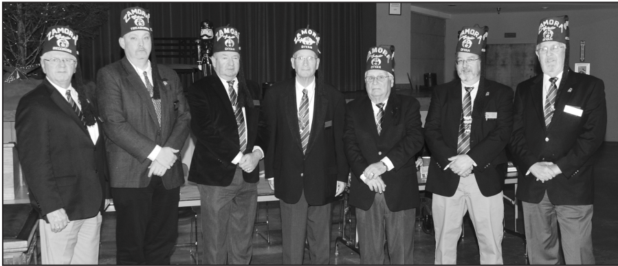
Introducing the 2015 Zamora Shrine Divan.