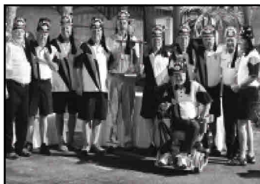
Dune Buggies High Point