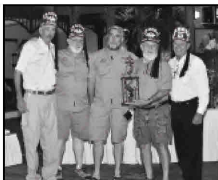
Band of Bazzaraqs