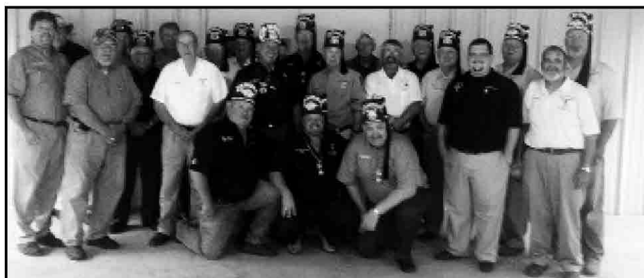
Meeting at the North West Alabama Shrine Club