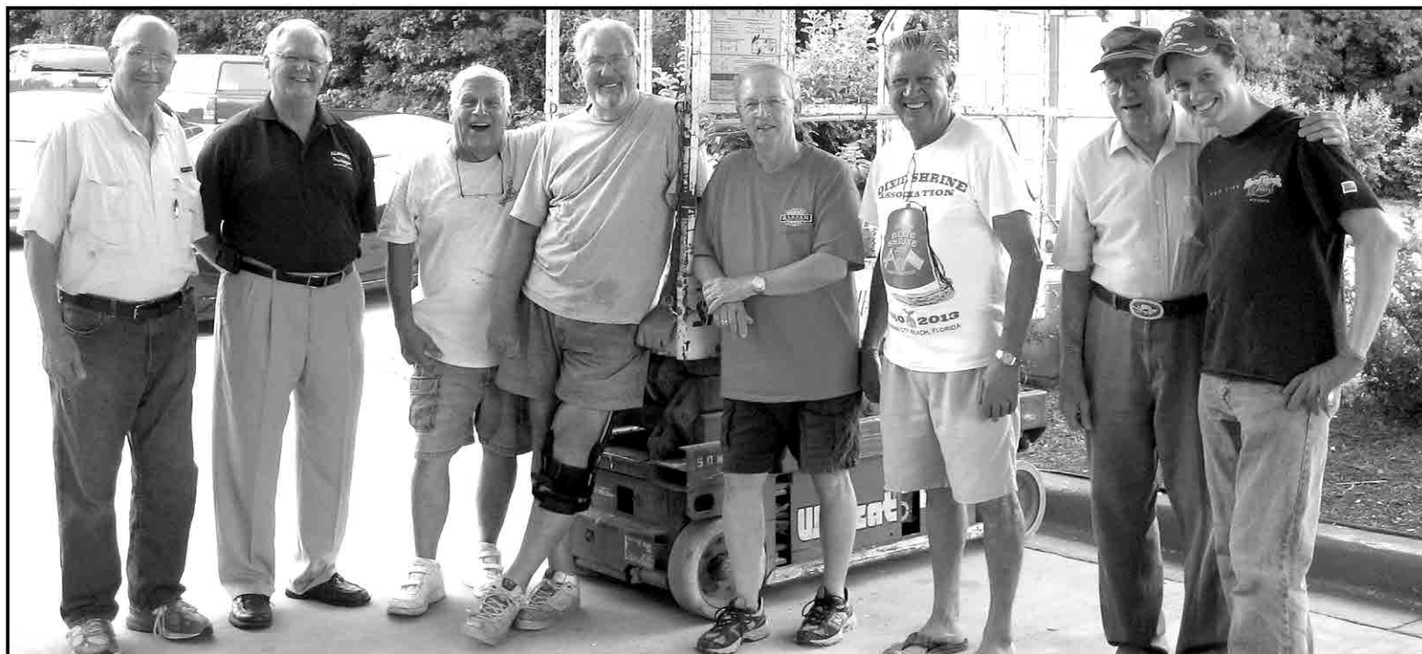
Work Day volunteers.