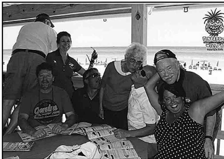
Legends having fun and making memories.