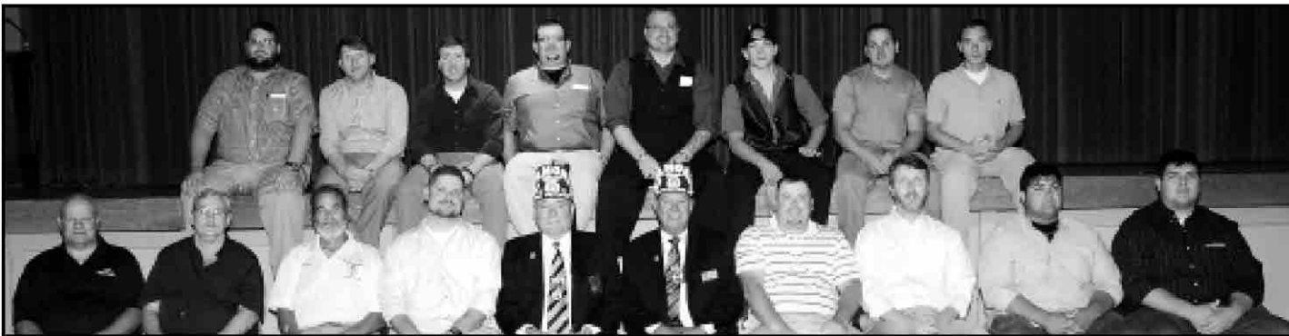
Candidates at the Spring Ceremonial