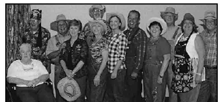
Cahaba Ball Hillbilly style.