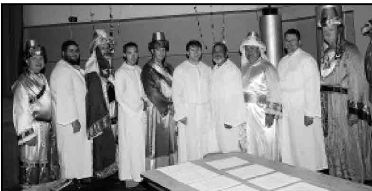
Members of Zamora's Ritualistic Cast and candidates.