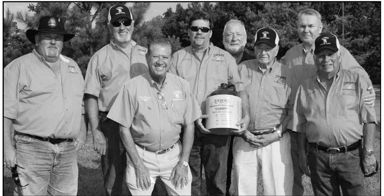
Zamora's Motor Corps. Unit with the Little Brown Jug.