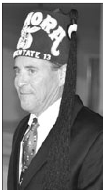
Preparing to take the Oath.