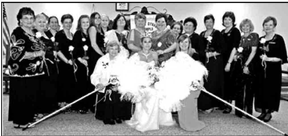
Members of the Daughters of the Nile Aromaz Dynasty on installation.