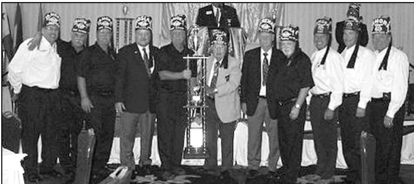
The high point winner "World Famous Dune Buggies." How those Buggies do roar!

The Buggies Drill Team has a very good start for a "Clean Sweep" for the year. With the Little Brown Jug coming up later this month, and the Southeastern in August, only time will tell if the "Plan" is still in tact.