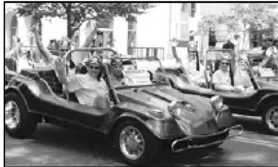
Members of our Divan and Nobles from the Dune Buggy Unit enjoying the Imperial Convention parade.