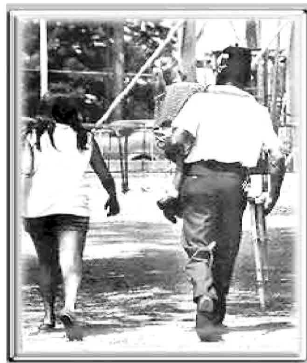
The famous "Editorial Without Words" photo.

Today, the famous photo has been reproduced on stained-glass windows, mosaics, tie tacs, pins and in statues. A larger-than-life replica of the "Editorial Without Words" stands outside the International Shrine Headquarters building in Tampa. Photographer Randy Dieter presently serves as graphics editor for the Kentucky Post.